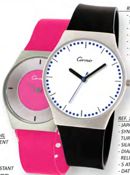
REF. 100225/100226 - JAPANESE MOVEMENT SEIKO SII PC21 - METAL ULTRA THIN CASE - SYNTHETIC STRAP - 3 ATM WATER RESISTANT - CASE Ø 100225: 31mm - CASE Ø 100226: 37mm