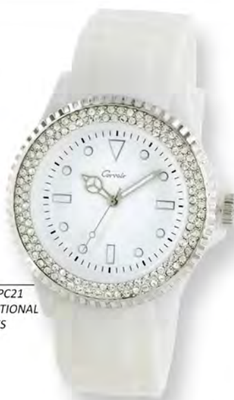
REF. 100215ST - JAPANESE MOVEMENT SEIKO SII PC21 - SYNTHETIC CASE WITH UNIDIRECTIONAL TURNING BEZEL SET WITH STONES - SILICONE STRAP - DIAL WITH INDEXES IN RELIEF - 5 ATM WATER RESISTANT - DATE (= REF. 100216ST) - CASE Ø 40mm