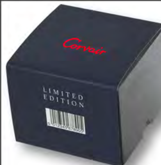
REF. 600189 - HIGH END CARTON BOX WITH SLEEVE - SHINY OR MAT FINISH - AVAILABLE IN ALL PANTONE COLORS - INSIDE: FOAM - LOGO CAN BE PRINTED ON BOX AND / OR SLEEVE - SIZE: 100m x 100mm x 80mm