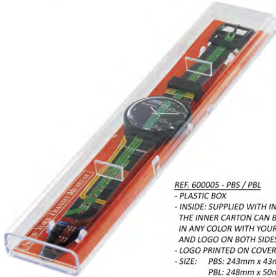
REF. 600005 - PBS / PBL - PLASTIC BOX - INSIDE: SUPPLIED WITH INNER CARTON THE INNER CARTON CAN BE PERSONALIZED IN ANY COLOR WITH YOUR OWN DESIGN AND LOGO ON BOTH SIDES - LOGO PRINTED ON COVER - SIZE: PBS: 243mm x 43mm x 18mm PBL: 248mm x 50mm x 18mm