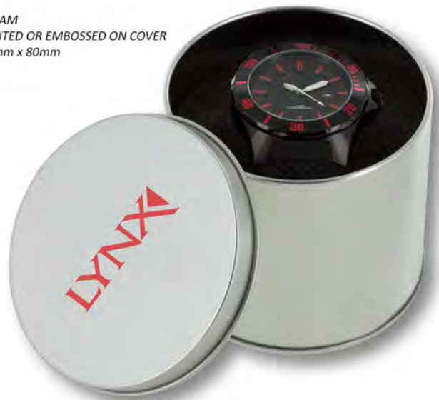
REF. 600003 - TIN CAN - INSIDE: FOAM - LOGO PRINTED OR EMBOSSED ON COVER - SIZE: Ø90mm x 80mm