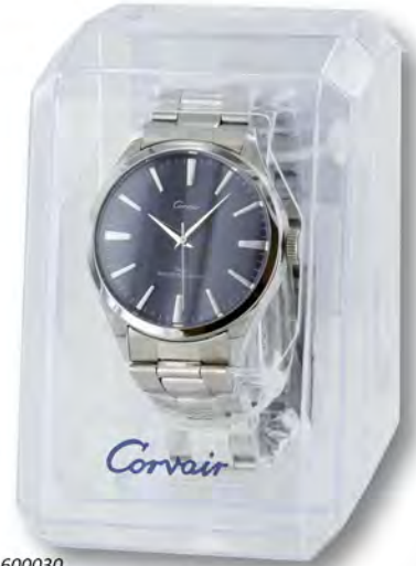
REF. 600030 - PLASTIC BOX WITH OPEN WINDOW - INSIDE: PLASTIC HOLDER. THE BOX CAN BE PERSONALIZED WITH A 4 COLOR PRINTED LABEL - LOGO PRINTED ON COVER - SIZE: 90mm x 80mm x 60mm