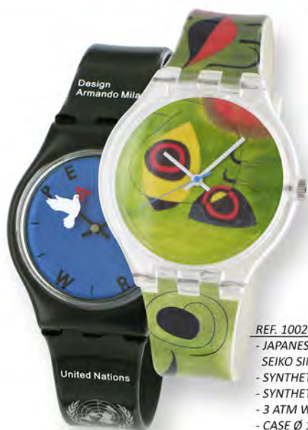
REF. 100204 / 100204L - JAPANESE MOVEMENT SEIKO SII PC21 - SYNTHETIC CASE - SYNTHETIC STRAP - 3 ATM WATER RESISTANT - CASE Ø 100204: 35mm - CASE Ø 100204L: 38mm