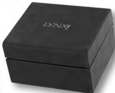
REF. 600058 - HIGH END WOODEN BOX - SIMILI LEATHER FINISH - INSIDE: SUEDE FINISH - LOGO PRINTED OR EMBOSSED ON COVER - SIZE: 110m x 125mm x 73mm