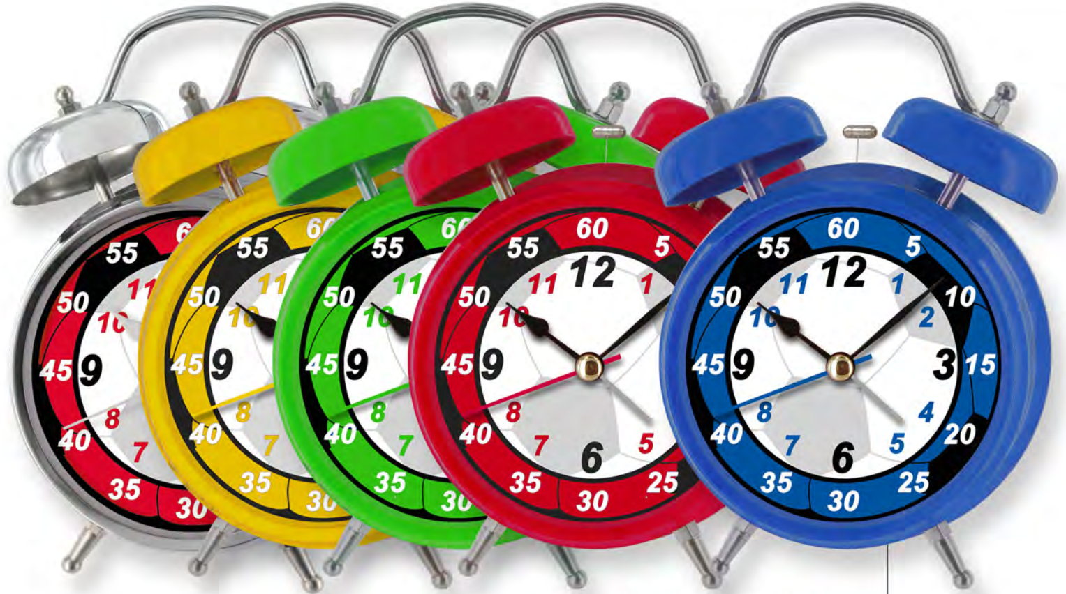
REF. 350410 - METAL BELL ALARM CLOCK