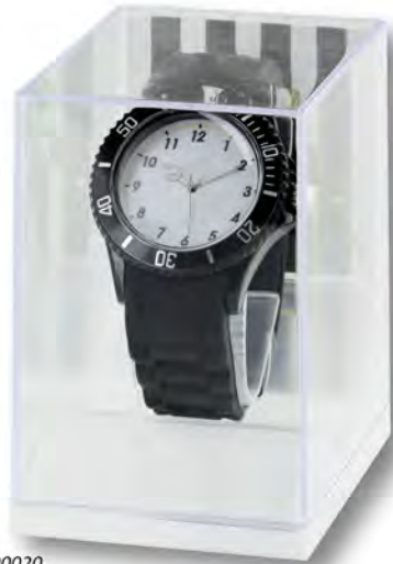
REF. 600020 - PLASTIC BOX - INSIDE: INSERT CARD. THE CARD CAN BE PERSONALIZED IN ANY COLOR WITH YOUR OWN DESIGN AND LOGO ON BOTH SIDES - LOGO PRINTED ON COVER - SIZE: 90mm x 80mm x 60mm