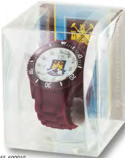
REF. 600010 - ACETATE BOX - INSIDE: PVC HOLDER WITH INSERT CARD. THE CARD CAN BE PERSONALIZED IN ANY COLOR WITH YOUR OWN DESIGN AND LOGO ON BOTH SIDES - SIZE: 90mm x 75mm x 70mm