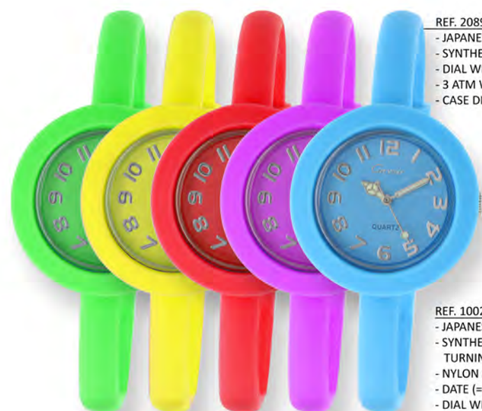
REF. 208953 - JAPANESE MOVEMENT SEIKO SII PC21 - SYNTHETIC CASE & STRAP - DIAL WITH NUMBERS IN RELIEF - 3 ATM WATER RESISTANT - CASE DIAMETER 35mm