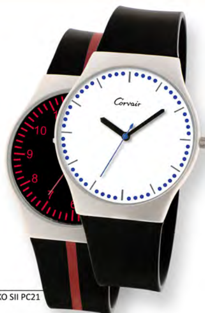
REF. 100226 - JAPANESE MOVEMENT SEIKO SII PC21 - METAL ULTRA THIN CASE - SYNTHETIC STRAP - 3 ATM WATER RESISTANT - CASE DIAMETER 100226: 37mm