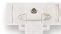
Clip and Pin