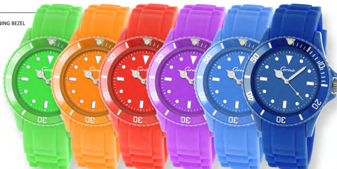
REF. 100215S - JAPANESE MOVEMENT SEIKO SII PC21 - SYNTHETIC CASE WITH UNIDIRECTIONAL TURNING BEZEL - SILICONE STRAP - DATE (= REF. 100216S) - DIAL WITH INDEXES IN RELIEF - 5 ATM WATER RESISTANT - CASE DIAMETER 40mm