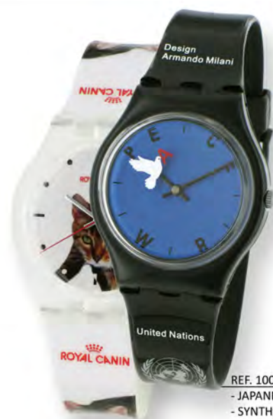
REF. 100225 - JAPANESE MOVEMENT SEIKO SII PC21 - METAL ULTRA THIN CASE - SYNTHETIC STRAP - 3 ATM WATER RESISTANT - CASE DIAMETER 100225: 31mm