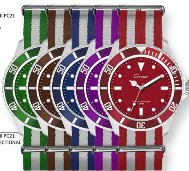
REF. 100215NS - JAPANESE MOVEMENT SEIKO SII PC21 - SYNTHETIC CASE WITH UNIDIRECTIONAL TURNING BEZEL - NYLON STRAP - DATE (= REF. 100216NS) - DIAL WITH INDEXES IN RELIEF - 5 ATM WATER RESISTANT - CASE DIAMETER 40mm