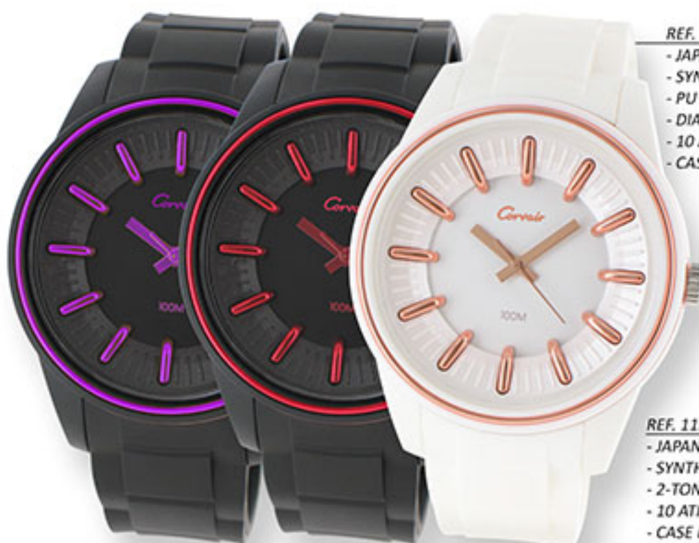
REF. 111561 - JAPANESE MOVEMENT MIYOTA 2035 - SYNTHETIC CASE - PU STRAP - DIAL WITH INDEXES IN RELIEF - 10 ATM WATER RESISTANT - CASE DIAMETER 46mm