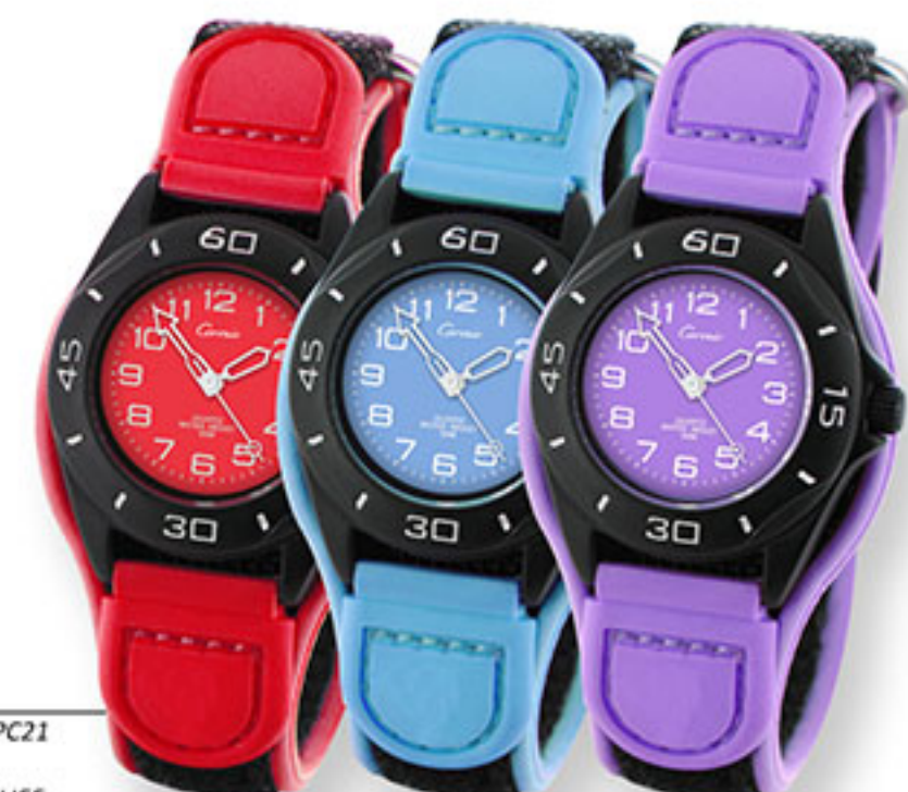
REF. 200085 - JAPANESE MOVEMENT SEIKO SII PC21 - BLACK METAL CASE - VELCRO STRAP WITH LOGO IN RELIEF - 5 ATM WATER RESISTANT - CASE DIAMETER 34mm