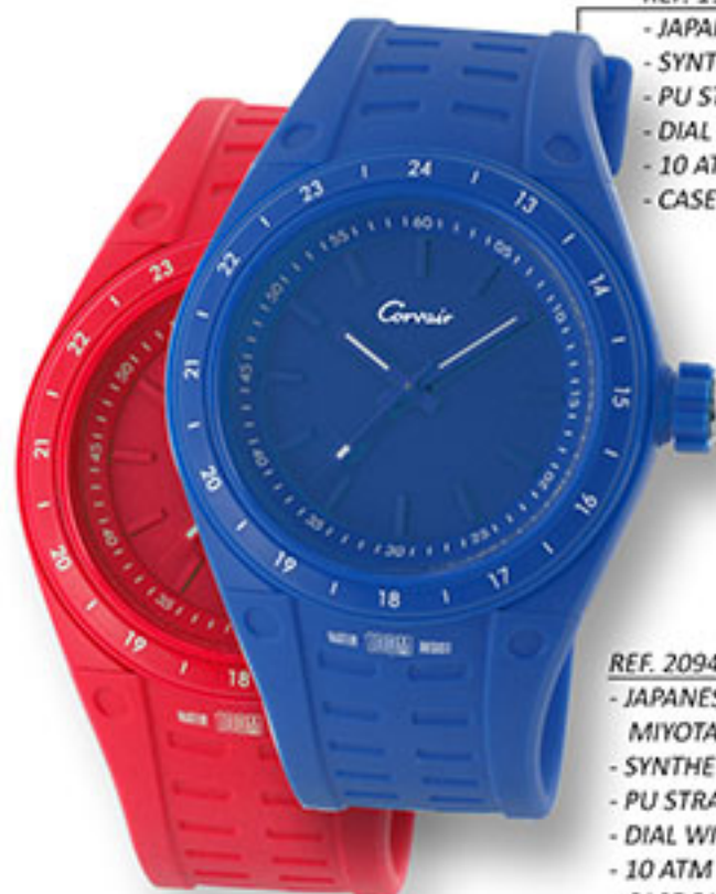
REF. 110499 - JAPANESE MOVEMENT MIYOTA 2035 - SYNTHETIC CASE - PU STRAP - DIAL WITH INDEXES IN RELIEF - 10 ATM WATER RESISTANT - CASE DIAMETER 44mm