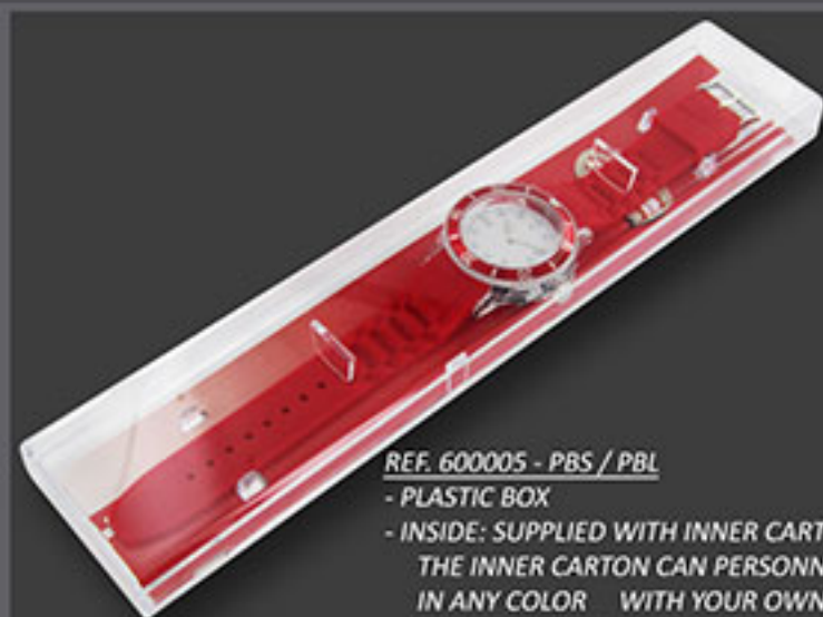
REF. 600005 - PBS / PBL