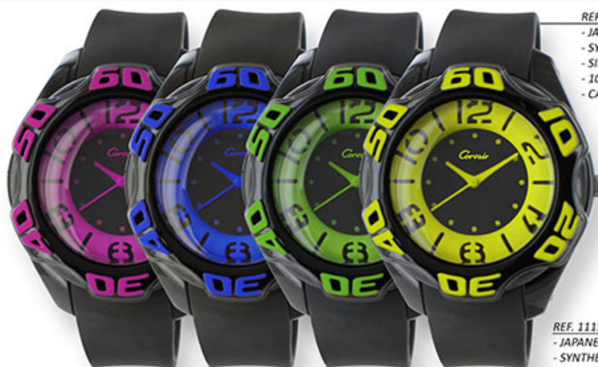
REF. 110016 - JAPANESE MOVEMENT MIYOTA 2035 - SYNTHETIC CASE - SILICONE STRAP - 10 ATM WATER RESISTANT - CASE DIAMETER 45mm