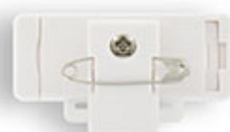
PIN AND CLIP ATTACHEMENT