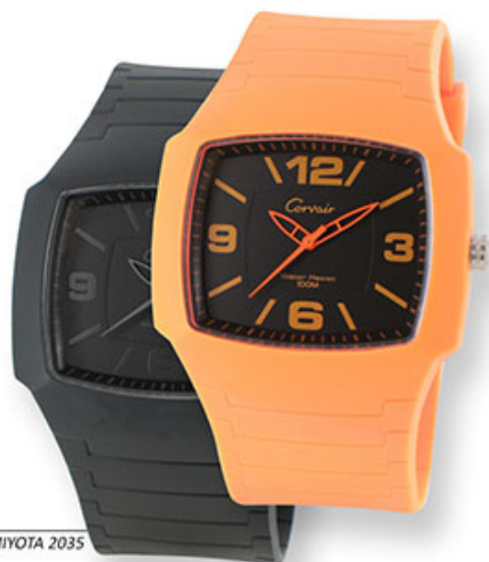
REF. 110507 - JAPANESE MOVEMENT MIYOTA 2035 - SYNTHETIC CASE - PU STRAP - DIAL WITH INDEXES IN RELIEF - 10 ATM WATER RESISTANT - CASE SIZE 44 x 30mm