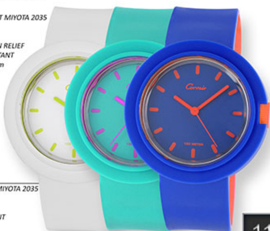
REF. 113603 - JAPANESE MOVEMENT MIYOTA 2035 - SYNTHETIC CASE - 2-TONE PU STRAP - 10 ATM WATER RESISTANT - CASE DIAMETER 45mm