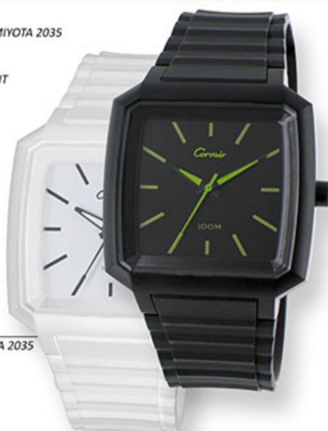
REF. 111568 - JAPANESE MOVEMENT MIYOTA 2035 - SYNTHETIC CASE - PU STRAP - 10 ATM WATER RESISTANT - CASE SIZE 40 x 40mm